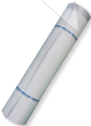
KÖSTER TPO SK (FR) Membrane